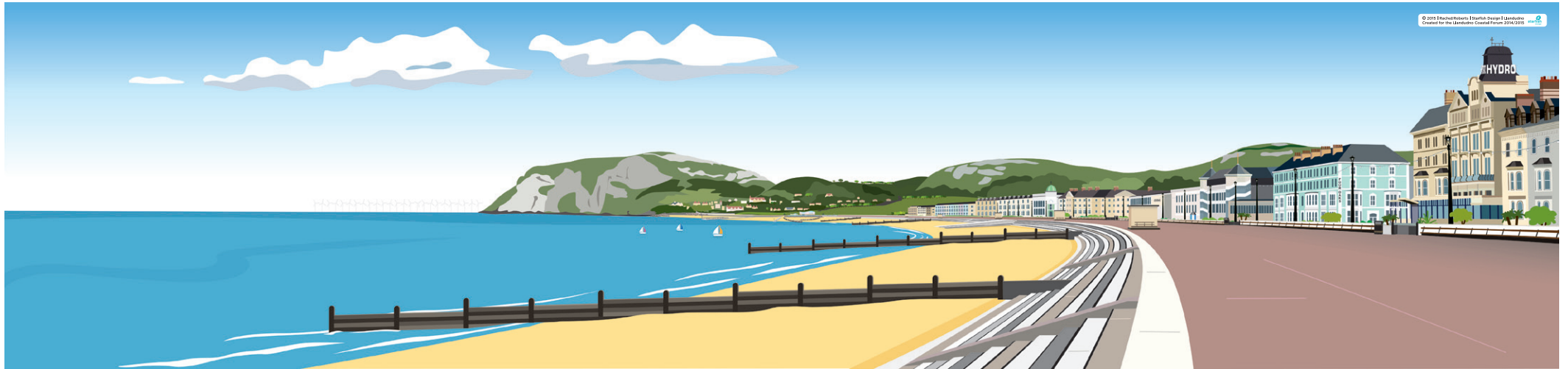
2. Imported sand/shingle beach with traditional groynes