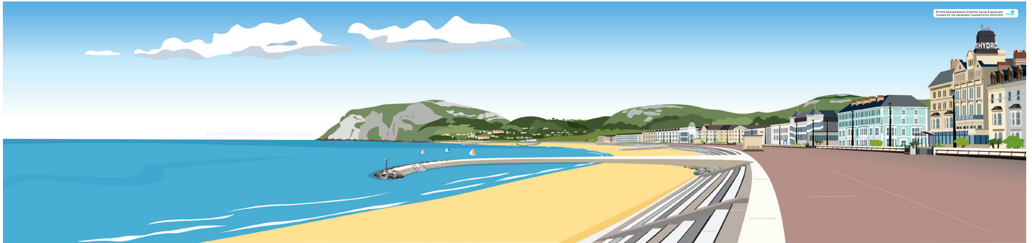
1. Imported sand beach with shore connected breakwaters