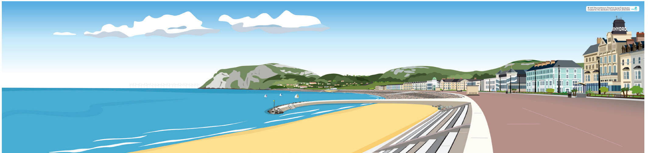
1. Imported sand beach with shore connected breakwaters