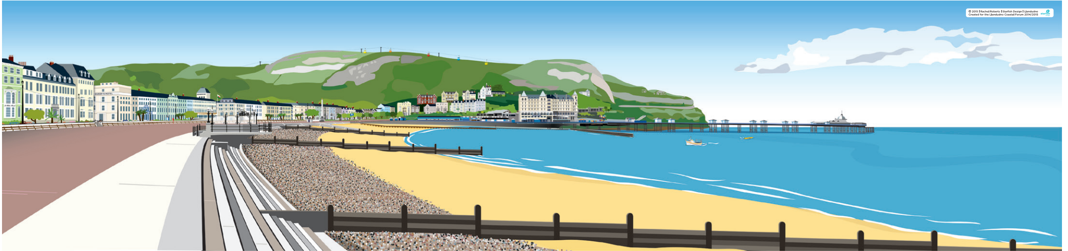
3. Imported sand/shingle beach with traditional groynes