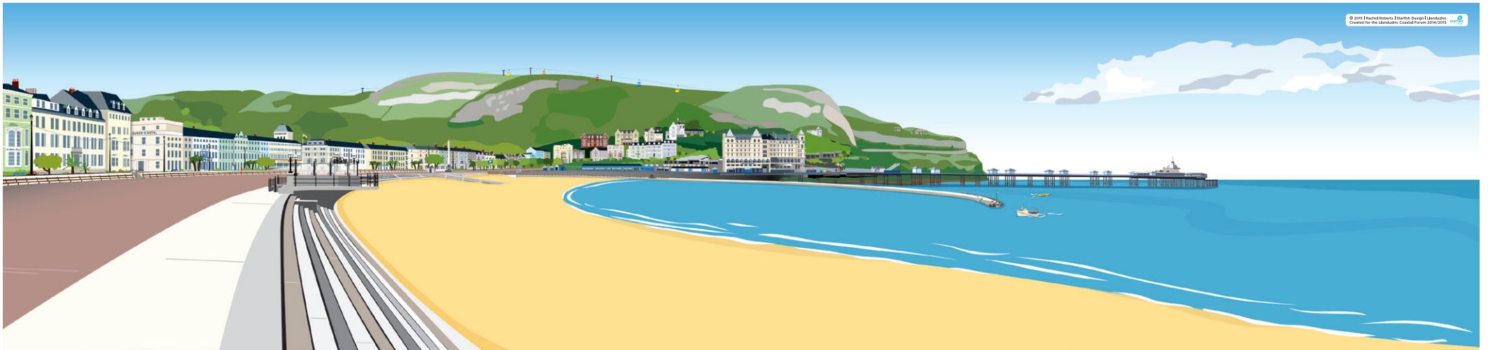
2. Imported sand beach with shore connected breakwaters