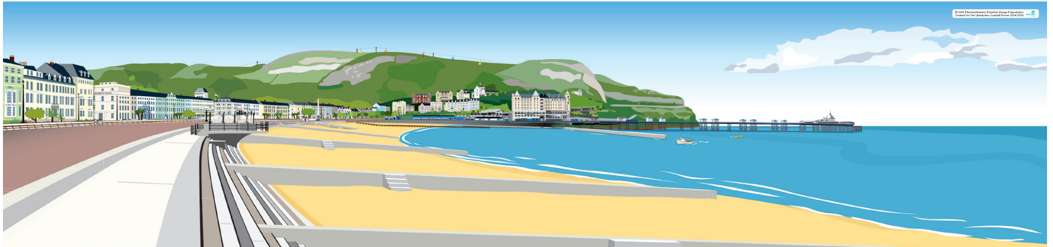
3. Imported sand/shingle beach with traditional groynes